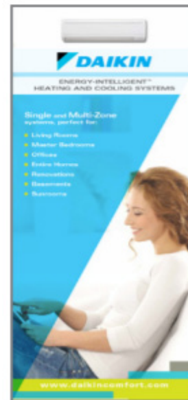
Daikin Retractable Banner Product ID: 451384 $450 Rental Fee

Contact your local branch for availability. Dealers will be billed a rental fee when order is placed and refunded when materials are returned undamaged.