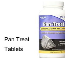
Pan Treat Tablets